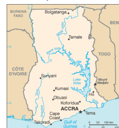
Map of Ghana

gifted national leaders. They build strong, trusting relationships, because they know the language and culture of the people they minister to. They are able to reach areas that are closed to outsiders and they have a passion to minister to their people. As these trusting relationships flourish, our leaders are able to share a message of hope for the future.